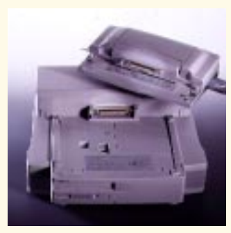
The Card Station II offers extra PC Card slots. The Desk Station V Plus comes with SCSI-2 and PCI/ISA slots – among other things!