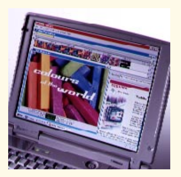
The 12.1-inch colour TFT screen has a resolution of 1024 x 768.