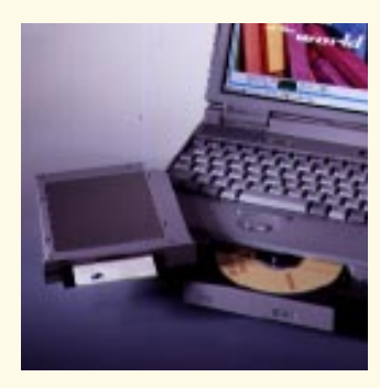
The Toshiba SelectBay: swapping between CD-ROM and floppy disk drives takes just seconds.